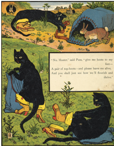
Puss in Boots

In this activity sheet you'll learn about Walter Crane's 19th century children's book Puss in Boots . You'll also visit the Mirror of the World website to explore the actual book.