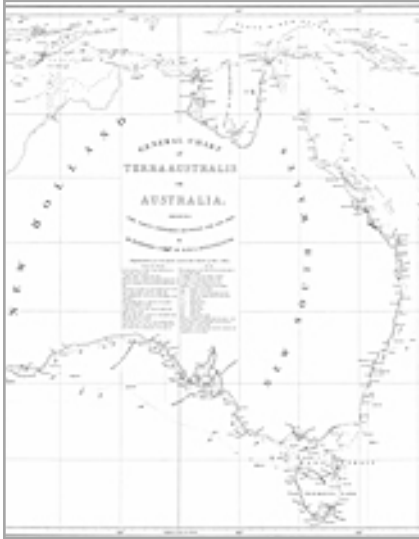
A Voyage to Terra Australis

In this activity sheet you'll learn about Matthew Flinders' voyage to Australia and how he produced and published one of the first complete maps of this continent. You'll also explore one of his maps which appeared in his book A Voyage to Terra Australis , and is featured on the Mirror of the World website.